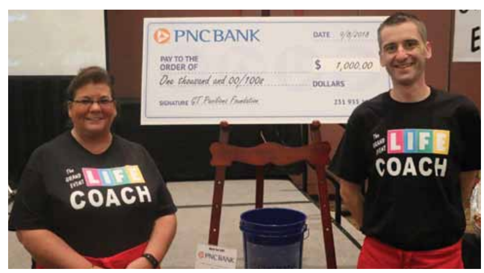
PNC Team members volunteer at the Grand Event: LIFE

Traditionally more than 80% of donations made to the Grand Traverse Pavilions Foundation are from individuals and local family foundations.