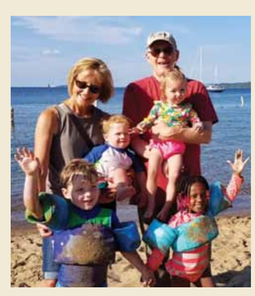
Being a Grandparent is one of the greatest gifts in my life. Come join us Saturday evening of Grandparents Day Weekend, September 8, 2018, to support the Grand Traverse Pavilions Foundation's Grand Event: LIFE