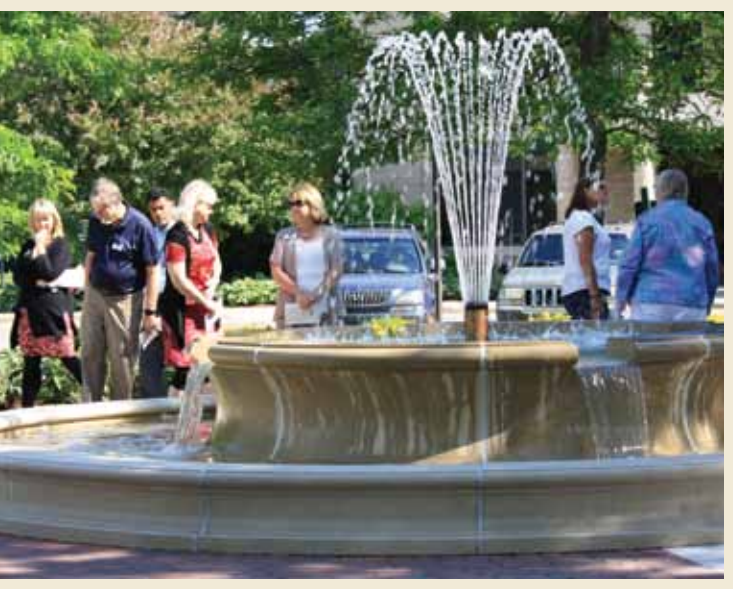
Guests enjoy the Pavilions Plaza and Fountain after the ceremony.