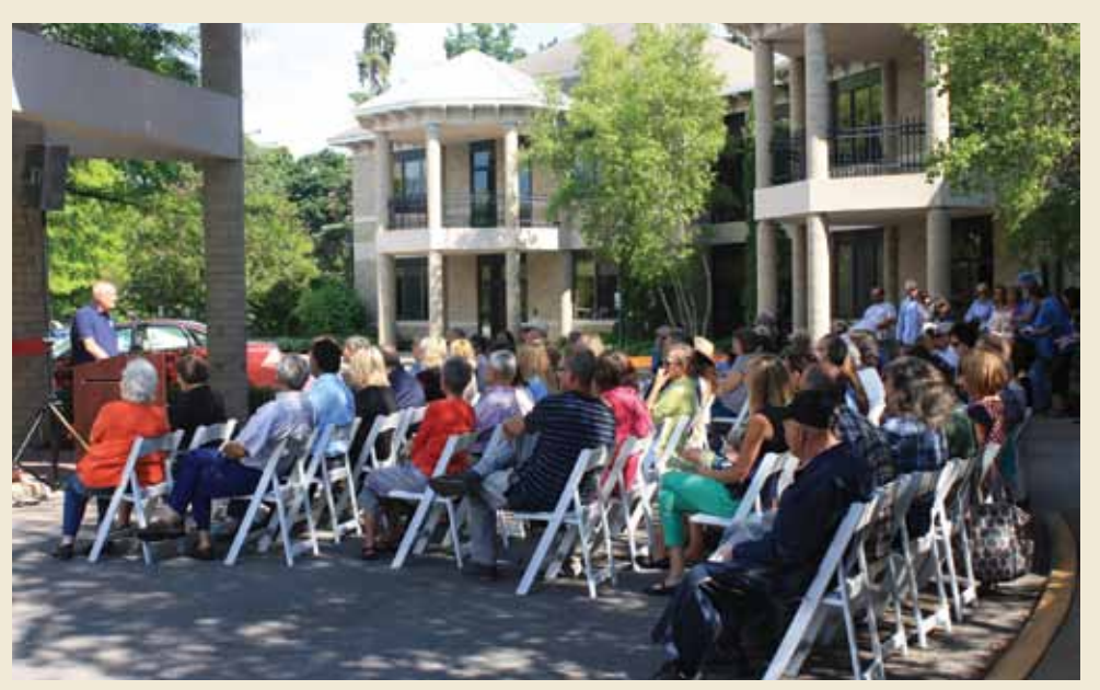
Over 100 members of the community attended the Rededication Ceremony.