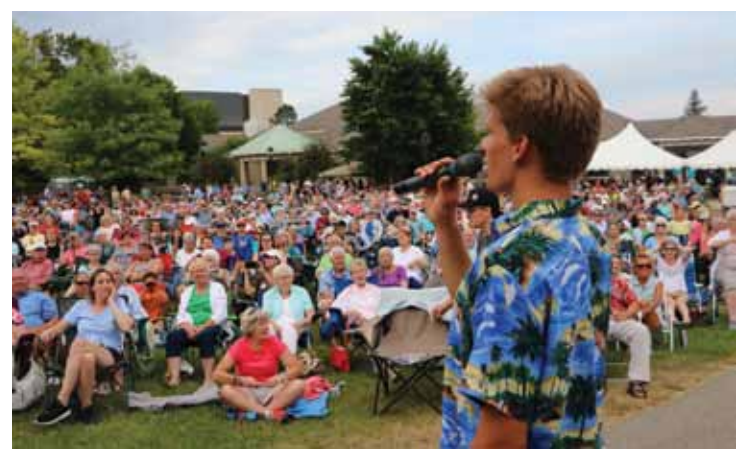
The Petoskey Steel Drum band brought in the largest crowd yet—there was barely a patch of grass to be found on our Grand Lawn.